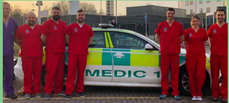
Above Photo The South East's SAS Advanced Practitioners.